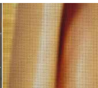
4 Transparent graphics Oversized mesh banners and building wraps cut at high speeds with motor-driven rotary tool.