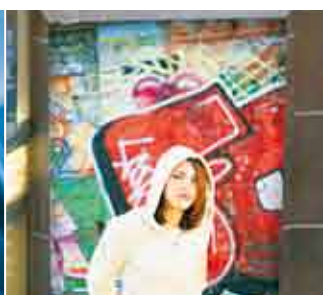
3 Light boxes Scrolling light boxes and backlit displays trim-cut perfectly at high speed.