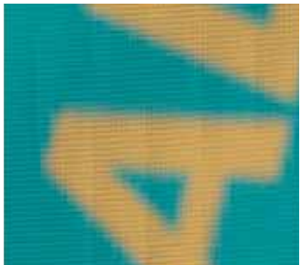
1 Textile, fabric banners/flags Porous flexibles for feather flags, banners, roll-ups. Cut perfectly using high-speed tooling and material transport.

With ever-increasing print speed and quality, digital printers have made many things possible – and even more, in combination with Zünd Cutters. The world's fastest and most accurate cutting system is at your disposal for automatically trimming and contour-cutting banners, posters, flags, and many other flexible materials faster and more productively than ever.