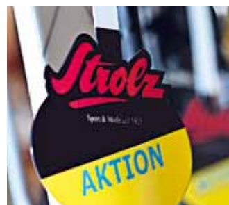
Shelf signage Contour-cut polypropylene shelf talkers for in-store promotions and window displays.

In today's competitive environment, eye-catching shapes and unusual materials are in high demand. Zünd's latest camera-guided cutting and routing technologies are capable of meeting these requirements better than ever. Structural designs, contour-cut displays – Zünd cutters will finish all varieties of common and newly developed materials easily, efficiently, and economically.