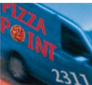
2 Vehicle graphics Pressure-sensitive vinyl for fleet graphics, vehicle wraps, and decals. Kiss-cut and contour-cut.