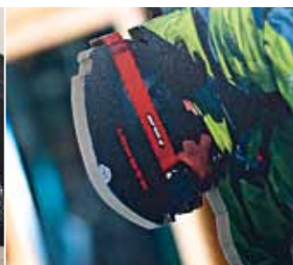
4 Displays Cut or routed lightweight POP/ POS materials up to 50 mm/2" thick. Ideal for in-store decorations.

KSM your partner in digital cutting ZUN swiss cutting systems