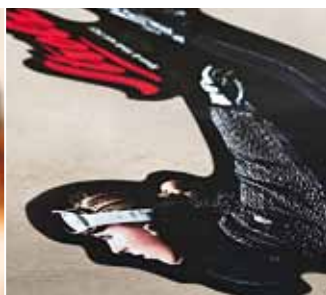
3 Floor graphics Laminated adhesive-backed vinyl, kiss-cut and through-cut, for floor decals and floor mats.